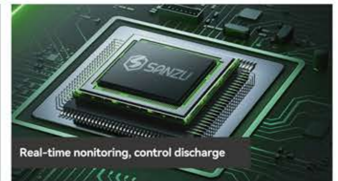
Real-time monitoring, control discharge