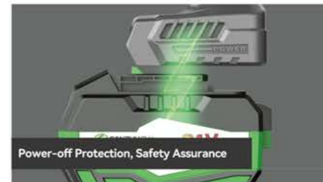
Power-off Protection, Safety Assurance