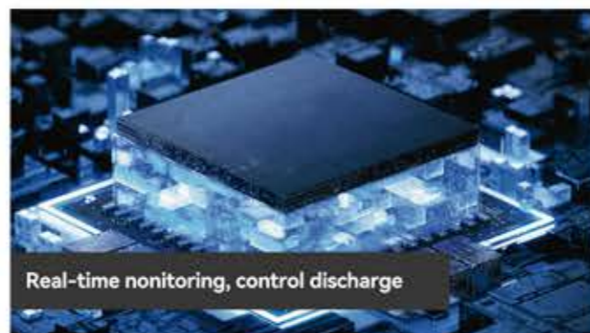
Real-time monitoring, control discharge