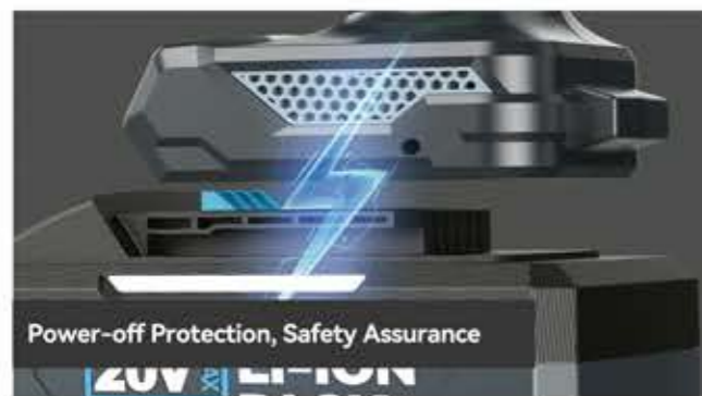
Power-off Protection, Safety Assurance

Combine Whatever You Want gives you unlimited flexibility in choosing tools, batteries, and chargers, saving costs, while truly buying only what you need